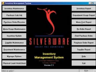
SilverWare Inventory Manager

Until recently Silverware has had a very quiet presence in Atlantic Canada. With minimal representation Silverware has been installed in some 11 restaurants. In March 2002 ON-LINE Computer Services became an Authorized Business Partner and dealer for Silverware software solutions. Following extensive training at Forsys's head office in Toronto ON-LINE is ready to deliver Silverware POS solutions to restaurants throughout the four provinces of Canada's East Coast.