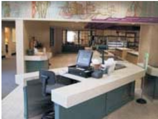
SilverWare Cafeteria POS